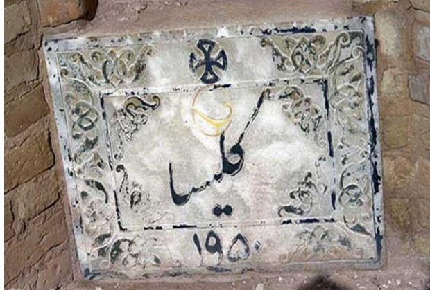
St. Andrew's Church in Kerman was bulldozed in 2011.

In the most recent incident, the 70-year-old Adventist Church was demolished by the order of the Municipality of Tehran on November 3, 2020. The building had a private owner and had been abandoned in recent years.<sup>377</sup> Although the church was not a nationally registered cultural heritage site, it had a symbolic cross, and the Iranian National Heritage Organization had stopped its demolition before.<sup>378</sup>