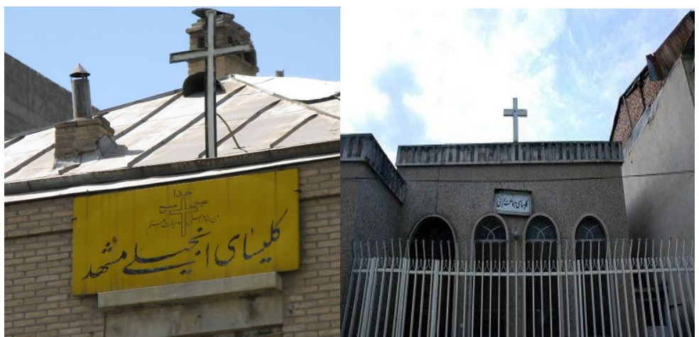
Anglican Church of Mashhad (left) and Assembly of God Church in Gorgan (right). Both churches are abandoned.

During the years after the end of the Iran-Iraq war, the number of new Christian converts who attended Persian-language church services, including in the Assembly of God congregations, increased. 88 In reaction, the Islamic Republic unleashed a new wave of oppression against evangelical churches, the Assembly of God in particular. 89 The Persian-language Assembly of God congregations in Mashhad, Sari, Kerman, Shiraz, Gorgan, Ahvaz, Tabriz, Kermanshah, and Arak were shut down from the late 1980s to the early 1990s. 90