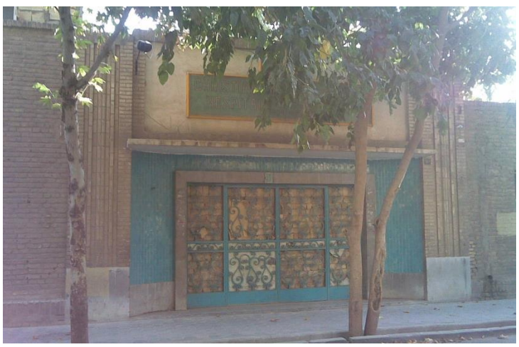
The Christian Hospital was confiscated and renamed in 1979 in Isfahan.

Similarly, the Christoffel and Nour Ayin institutes, which were both endowed for the benefit of the blind, were confiscated. Currently, they are semi-active or being used for other causes.<sup>356</sup> The bishop's house in Isfahan, which was the seat of the Anglican Church in Iran, was confiscated by the order of the Revolutionary Court in November 1979. Until recently, the house was left unused. In 2020, the Mostazafan Foundation restored the bishop's house.<sup>357</sup> In July 2021, the head of the Mostazafan Foundation declared that the bishop's house will become a museum.<sup>358</sup>