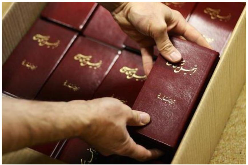
Bibles in Persian

The leaders of the Assembly of God Church and the Presbyterian Emmanuel Church were forced to halt their Friday services in 2009 and 2013, respectively. Friday is the official weekend in Iran; therefore, it was more convenient for churches to hold worship services on this day. In 2012, the Presbyterian Emmanuel Church and St. Peter's Evangelical Holiness Church, both located in Tehran, were also told to stop their services in Persian. Even the bookstores inside the churches were shut down. Those bookstores offered the Bible and Christian literature in Persian. The authorities did not want Christian literature to be accessible to the public. Currently, teaching and publishing Bible and other Christian literature in Persian is prohibited. 122