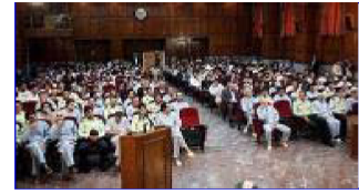
A general view of the courtroom shows suspected opposition supporters (in grey) in August 2009