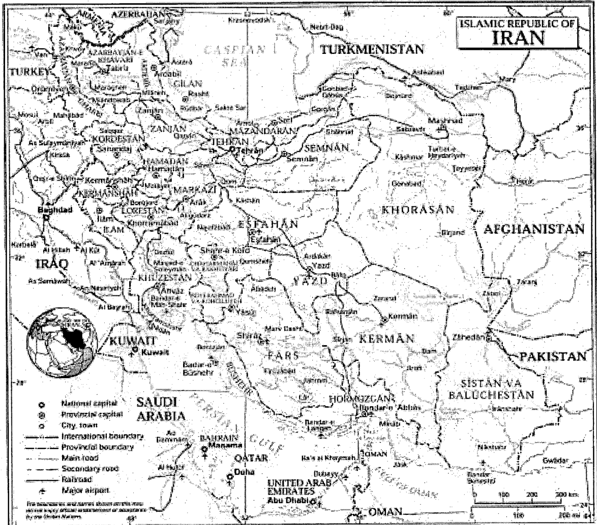
Map No. 1991 UNITED NATIONS June 1991

Department of Public Information Geographic Section