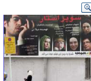
A woman walks under a billboard advertising an Iranian film