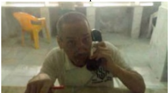
[Imprisoned human rights lawyer Abdolfattah Soltani on April 21, 2014, four days after the attacks]

On April 17, 2014, agents of the IRGC, Ministry of Intelligence, and hundreds of prison guards raided rooms 1 and 2 of Ward 350, which houses political prisoners at Evin Prison, beating prisoners with batons and other weapons.<sup>84</sup> More than thirty prisoners were reported as injured and it is believed that four prisoners were transferred to hospitals due to severe injuries. 85 After the raid, thirty-two political prisoners were transferred to solitary confinement. 86 Some of these prisoners suffered humiliation by being forced to take off their clothes before being placed in their solitary cells. 87 Prison guards shaved the heads of some prisoners, like human rights lawyer Abdolfattah Soltani, after they were transferred to solitary confinement in an attempt to humiliate them.<sup>88</sup>