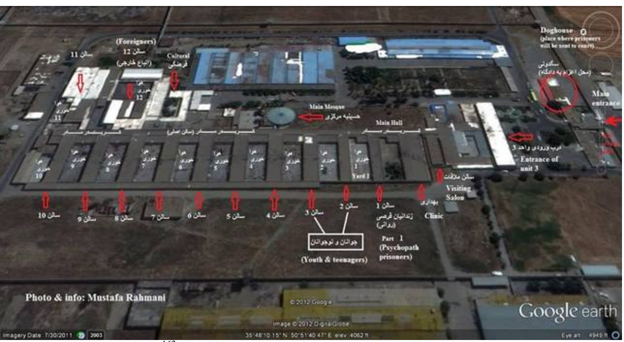
[Map of Qezel Hesar Prison<sup>162</sup>]