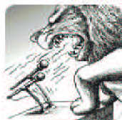
Disguised as lion