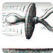
End of infancy