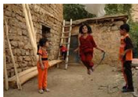
1 of 1 Full Size

Email | Print | Share | Reprints | Single Page [-] Text [+]